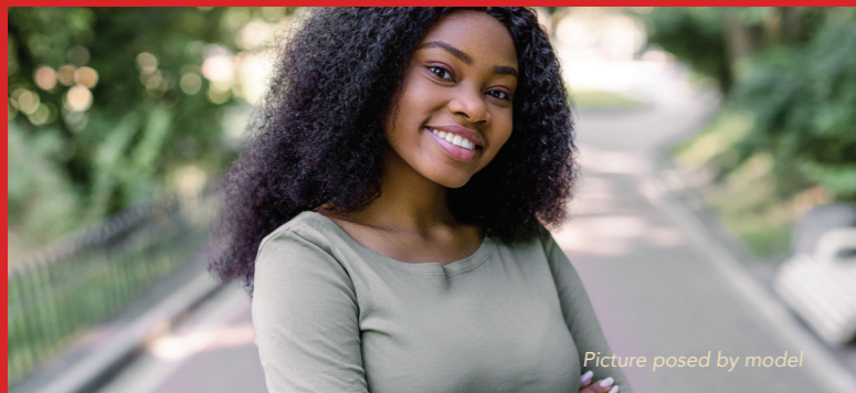
Picture posed by model

D uring the lockdown my wife's company began cutting jobs. She had been with this international organization for some time and had been praying for a new position. God heard her cry and my wife received a dream job that included a double increase of her former salary.