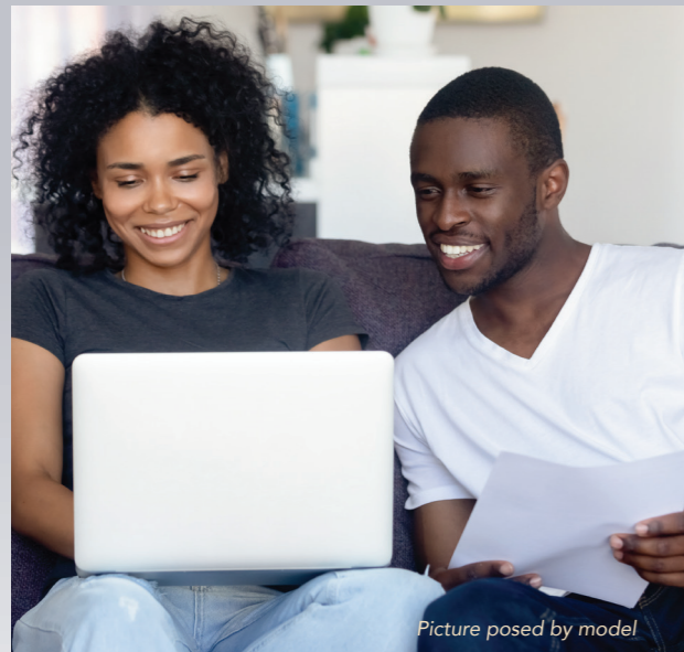
Picture posed by model